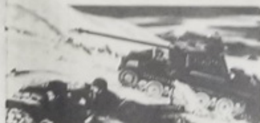
KIT NO. 502 GERMAN "PANTHER" TANK