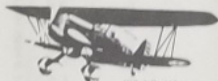
KIT NO. 114 CURTISS "HAWK" P-40