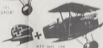
KIT NO. 184 GERMAN ALBATROSS D-3