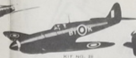
KIT NO. 28 BRITISH SPITFIRE