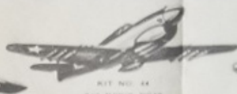
KIT NO. 44 P-40 FLYING TIGER