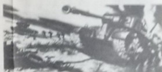
KIT NO. 501 M-48 "PATTON" TANK