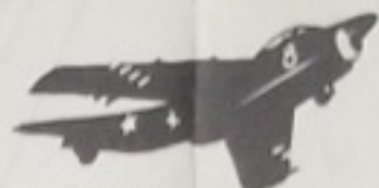
KIT NO. 48 RUSSIAN MIG 19