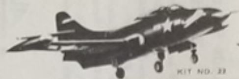
KIT NO. 22 P-99 PANTHER JET