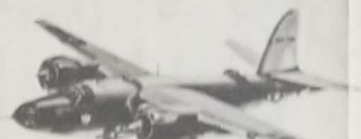
KIT NO. 32 B-24 MARTIN "MAUDAUER" BOMBER