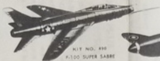
KIT NO. 430 P-100 SUPER SABRE

AURORA PLASTICS CORPORATION • West Hempstead, Long Island, New York