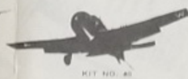
KIT NO. 40 HELLCAT