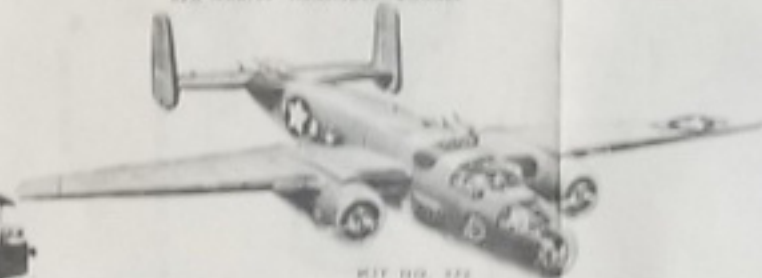
KIT NO. 224 B-25 MITCHELL BOMBER