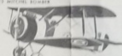
KIT NO. 188 SOPWITH CAMEL