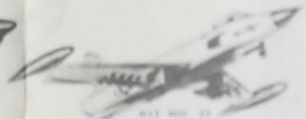
KIT NO. 26 F-80 LOCKHEED