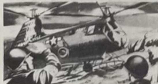
KIT NO. 562 M25 "ARMY MULE"