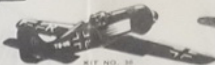
KIT NO. 38 FOCKE-WULF