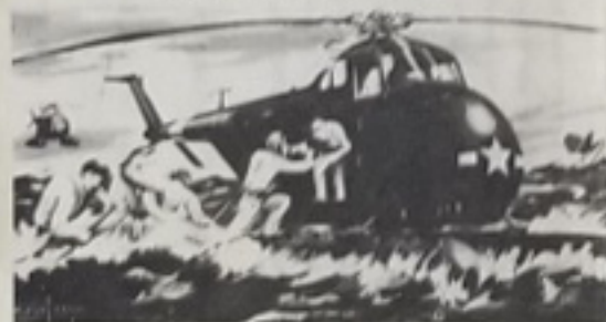
KIT NO. 593 SIKORSKY HO-4S "WINDMILL"