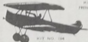
KIT NO. 184 FOKKER D-7