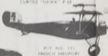
KIT NO. 181 FRENCH HEBRUPT