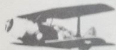
KIT NO. 42 CURTISS SBC-3 "HELLDIVER"