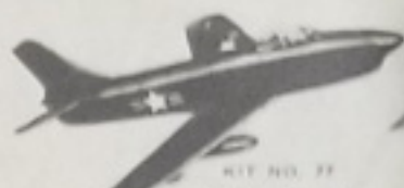
KIT NO. 24 F-80 SABRE JET