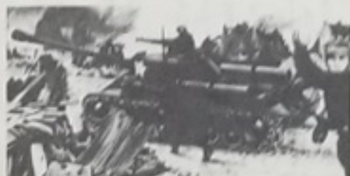
KIT NO. 501 RUSSIAN "STALIN" TANK