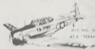
KIT NO. 20 AT-6 "TEXAN"