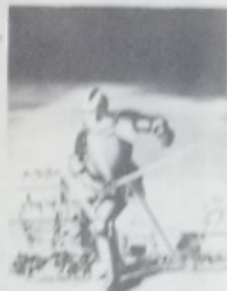
KIT NO. 46 SILVER KNIGHT OF AUGSBURG