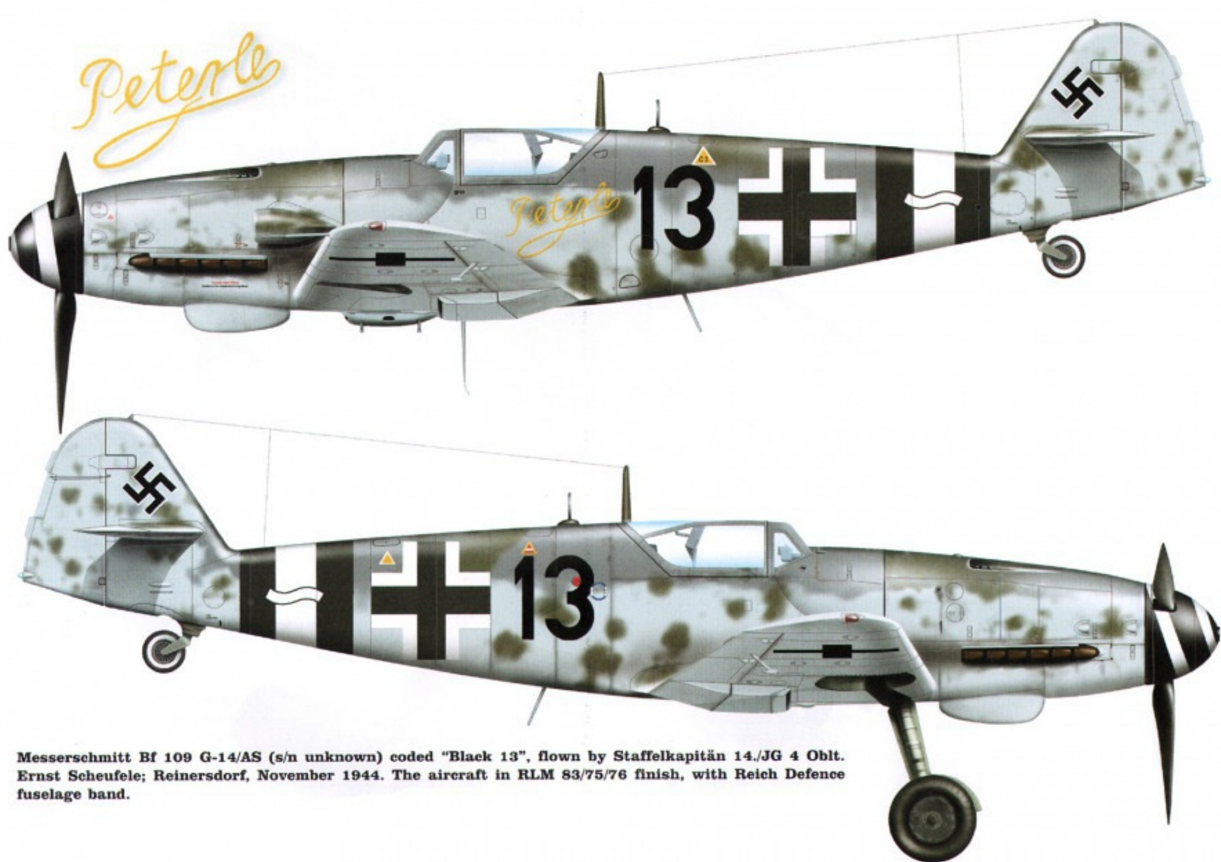
Messerschmitt Bf 109 G-14/AS (s/n unknown) coded "Black 13", flown by Staffelkapitän 14./JG 4 Oblt. Ernst Scheufele; Reinersdorf, November 1944. The aircraft in RLM 83/75/76 finish, with Reich Defence fuselage band.