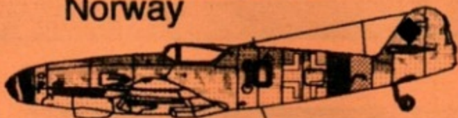
Bf109G-10, JG5 Norway

Black 10 was a Bf 109G-10/R3 flown by IV./JG 5 in Norway early in 1945. Colour scheme was 74/75/76 with the engine cowlings and rudder appearing to be replacement parts from other aircraft. Note the cowlings much heavier mottle and the rudders high camouflage demarcation line. Spinner is black with a white spiral.